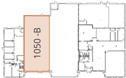
1050 Corporate Blvd